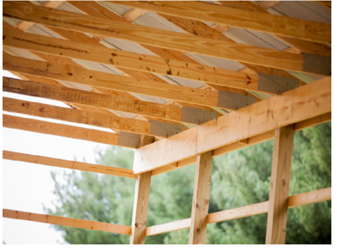
Taking MPC Wood Trusses to New Heights, Spans, and Spacings

Figure 1.