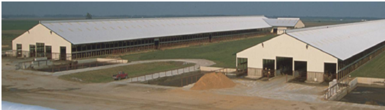
Old Barn vs New Barns