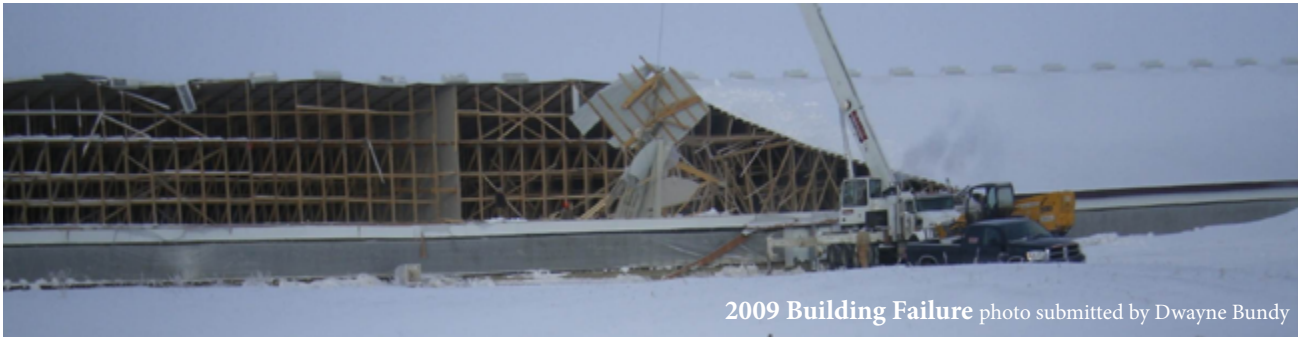
2009 Building Failure

9 degrees below normal, low temperature average was 13 degrees below normal. The area had only two days above freezing in this stretch, February 3rd and 4th. On March 12th the area had 1.1 inches of rain adding weight to snow-covered roofs. (NOAA, Lock and Dam #4; Alma, WI) More than 100 farm structures failed in Buffalo County from March 12th to April 15th with an estimated financial loss of more than $10,000,000. (STORM Disaster Reports, Buffalo County Farm Service Agency) The damage also spread beyond the county throughout the middle 1/3 of the state and had a severe economic and social impact on farmers in the region.