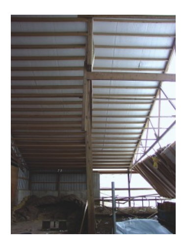
Figure 1: Buckling of a nail-laminated post due to improper design. Also visible is the buckling of the compression web chords due to improper bracing.

A prime example of the problems this causes was on full display in Myren's freestall barn and the other five failed buildings I visited the same day. Many of these buildings had seriously under-designed interior columns. As constructed, most of these columns would have an allowable axial design load of zero (0) which explains the classic buckling observed (figure 1). Other major deficiencies included no column sideway control at connections between interior columns and trusses, no accounting for additional loads induced by drifting snow